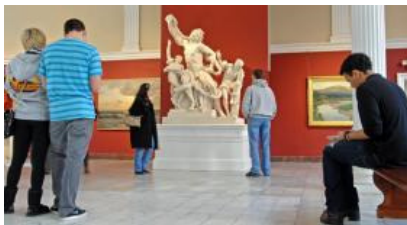
Visitors study Greek sculpture at the Telfair Academy during Super Museum Sunday.