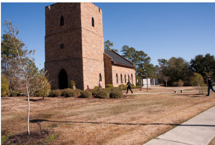
Super Museum Day (56 photos)