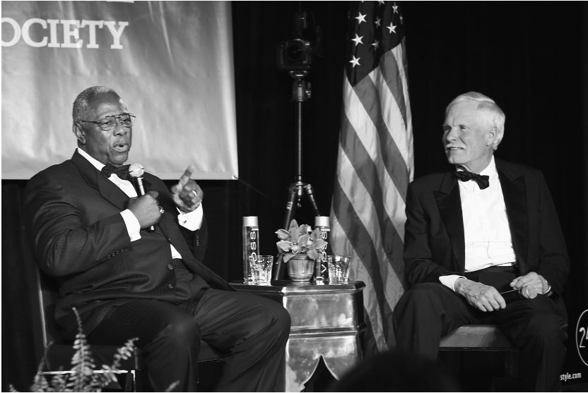
Baseball legend Henry Aaron (left) and media mogul Ted Turner (right) were inducted as the newest Georgia Trustees at GHS's Trustees Gala in Savannah on February 13, 2010.

Isakson joined us to honor and induct as Georgia Trustees two legendary Georgians whose fame is worldwide, Ted Turner and Hank Aaron.