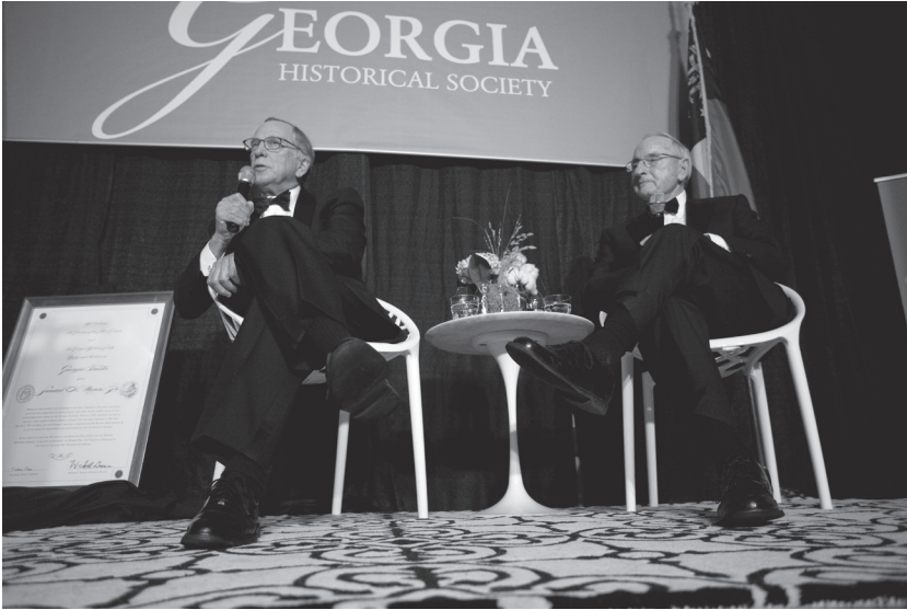
Sam Nunn (left) and Vince Dooley (right) at the Georgia Historical Society's Trustees Gala on February 12, 2011. Senator Nunn and Coach Dooley were the 2011 Trustee inductees.

or ignored topics such as African Americans, women, Unionists, and the home front were installed in every corner of the state: Dalton, Quitman, Atlanta, Savannah, Milledgeville, Augusta, Columbus, McCaysville, and Dawsonville. In addition, seven missing markers were replaced along the route of Sherman's March to the Sea, so that now the entire route from Atlanta to Savannah can be traced.