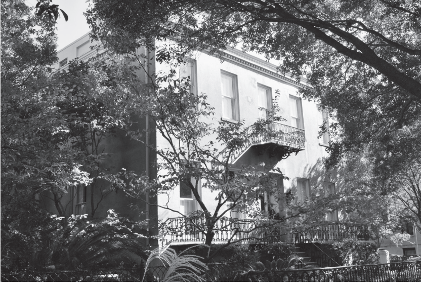
Jepson House, the newest addition to the Georgia Historical Society campus in Savannah.

to Hodgson Hall in the northwest corner of Gaston and Whitaker streets and consists of a three-story antebellum mansion and carriage house built in 1856. It adds nearly nine thousand square feet of buildings and one acre in grounds and gardens to our Savannah campus, which will be used as the new education center and administration building for GHS. Once the renovation is complete, GHS will transfer approximately fifteen programming and administrative employees to Jepson House (the archivists and library reference staff will remain in Hodgson Hall). This will provide appropriate office and work space for our employees and create room in Hodgson Hall for expanding the archives, increasing our archival storage capacity by 25 percent.