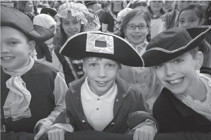
A few of the three thousand school children who marched in the annual Georgia Day parade on February 11, 2011.

This audience includes tens of thousands of school children, whose teachers begin the day by showing the program and then utilizing curricula developed by GHS specifically for that segment. Indeed, teachers and their students have become the greatest fans and consumers of the show. “My kids love ‘Today in Georgia History,’” reported a Barrow County middle school teacher who is using it in her classroom. “Several of them have seen the clips and share them with their families.” The program “has become an important part of the curriculum,” she enthused. “We get to talk about issues, people, and places that both appear