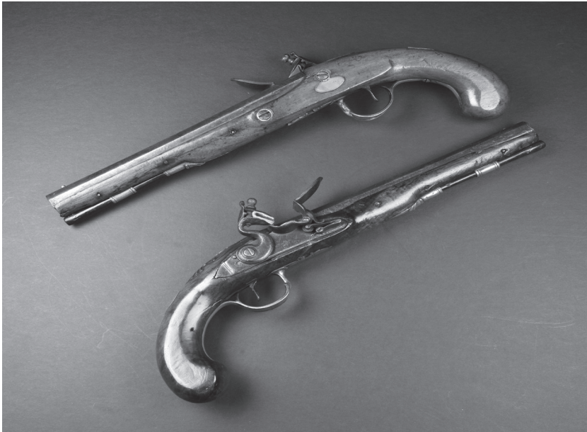
The pistols used in the Button Gwinnett-Lachlan McIntosh duel during the American Revolution. Through a $200,000 federally-funded Institute for Museum and Library Services grant project, GHS cataloged and digitized thousands of maps, portraits, and artifacts like these that had been previously unavailable or required a visit to the GHS library to view.

purchased) online. Through a $200,000 Institute for Museum and Library Services grant project ($100,000 in federal funds matched by $100,000 in private funds), we cataloged and digitized thousands of maps, portraits, and artifacts that had been previously unavailable, or which required a visit to our research library. Students, teachers, and scholars may now find descriptions of these materials on our web site and see photographs of portraits and artifacts such as the pistols used in the Button Gwinnett—Lachlan McIntosh duel, flags from the Civil War, personal effects of Girl Scout founder Juliette Gordon Low, paintings of James Oglethorpe and the compass he used to lay out Georgia's first city, uniforms and equipment used by Georgians in World War I and World War II, artillery shells and swords from the Revolutionary War, a Cherokee belt from the Removal period, and myriad personal effects of Georgians from every time period and every walk of life. Completion of this phase of our multiyear technology