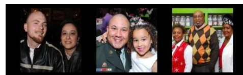
West Broad Street YMCA 1942-2011

Featured Photos - 9 total ( Expand ) next »