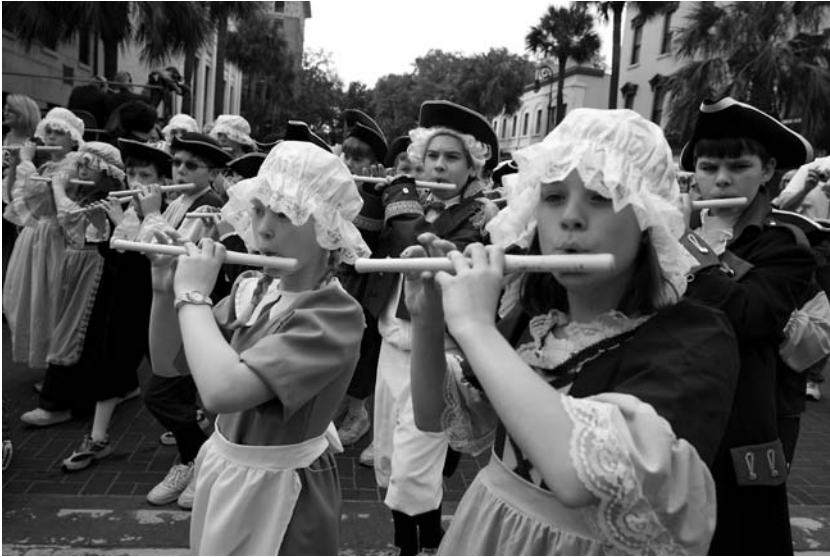
Thousands of costumed schoolchildren marched in the GHS's Georgia Days parade on February 12, marking the 275th anniversary of the founding of Georgia.

As we celebrated our state's founding with these elaborate programs and ceremonies, we worked just as vigorously to provide access to the primary sources that form the foundation for scholarly research. Our library and archives continued to preserve the record of our past and to reach out to those around the globe who seek to gain a deeper understanding by exploring these documents, photographs, and artifacts. Nearly 5,500 patrons were served, nearly fifty new collections were processed and made accessible to the public, and over 1,000 additional manuscript collections and 750 books were catalogued and made available for research.