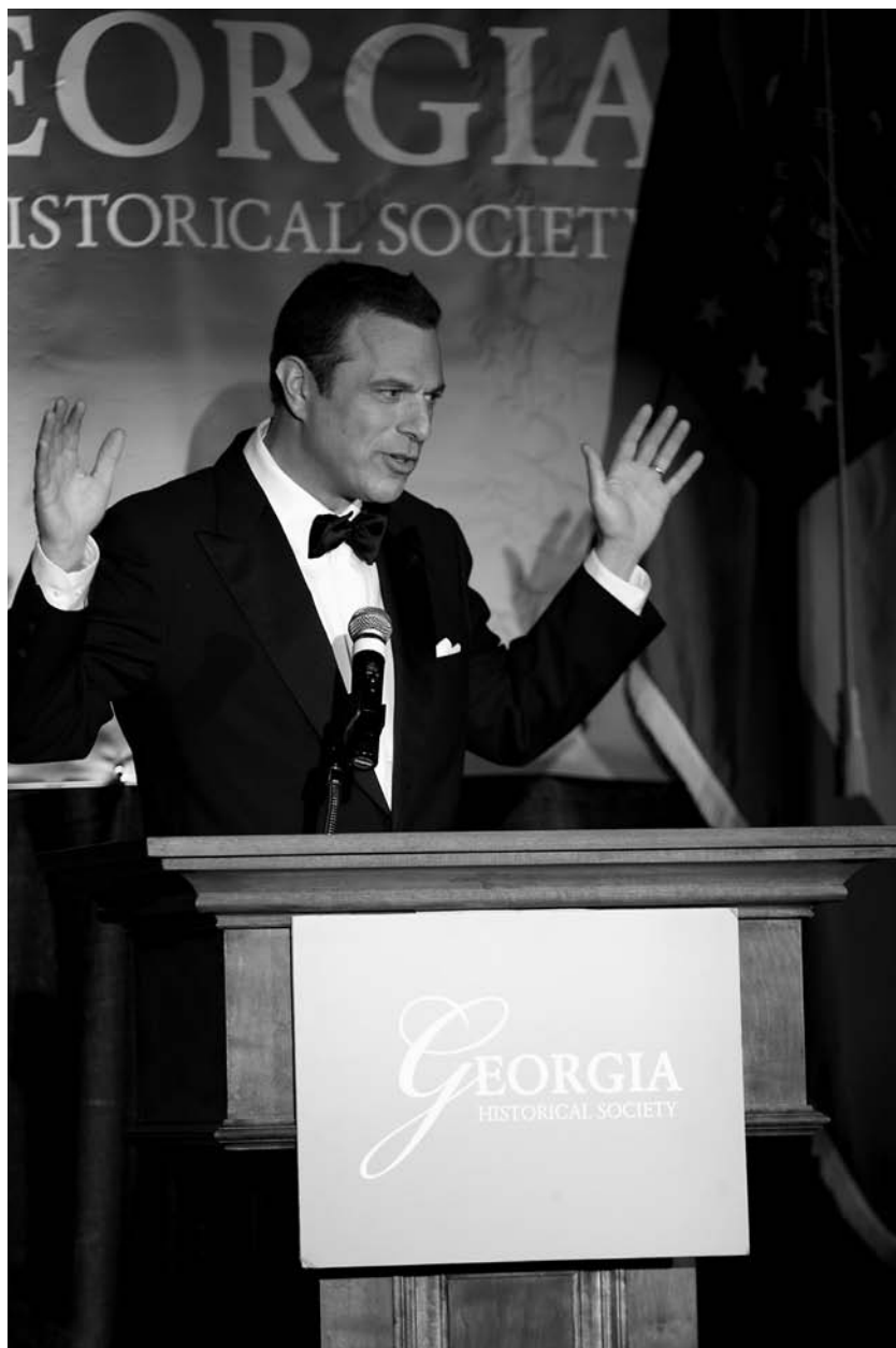
NBC Presidential Historian Michael Beschloss delivered the keynote address at the 275th Birthday Bash and Awards Gala in February.